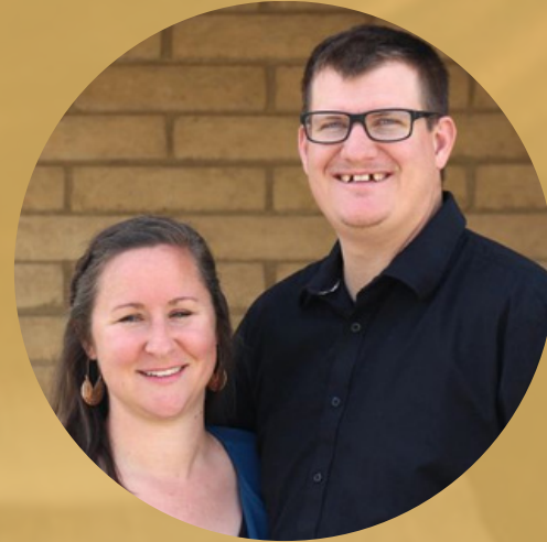
The Irvines CHURCH PLANTING INTERNS

11611 N. 51ST AVENUE. GLENDALE, AZ 85304