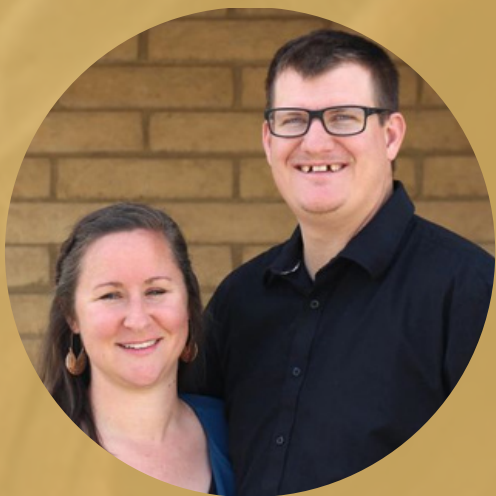
The Irvines CHURCH PLANTING INTERNS